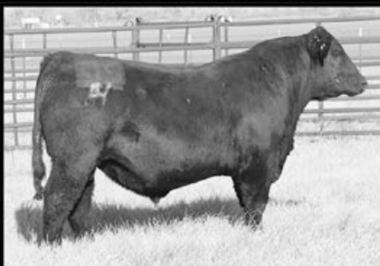
RT COMMERCE 3L AAA *20936934

CEB BW WW YW MK MRB RE $B $C +9 +2.2 +94 +164 +25 +.92 +.94 +203 +312