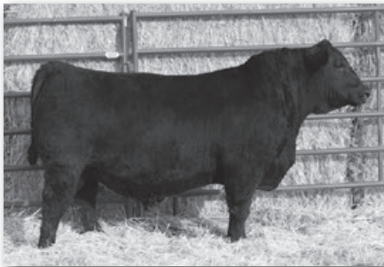
33861 AAA 20998698 09/08/2023 Sire: B A R Dynamic CED 16 | BW -1.9 | WW 79 | YW 141 M 23 | RE .63 | Mrb 1.19 | $M 82 | $C 322