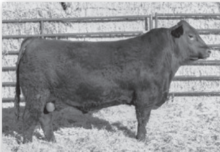
33278 RAAA 4938438 08/25/2023 Sire: 9 Mile Franchise 6305 CED 14 | BW -3.4 | WW 67 | YW 116 | M 29 REA .36 | Mrb .53 | ProS 132 | HB 58 | GM 74