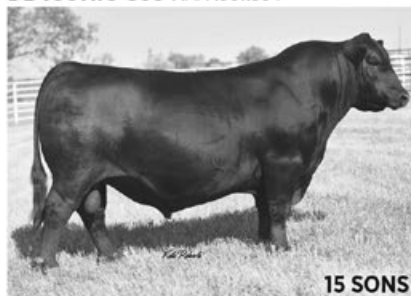
DB ICONIC G95 AAA 19611994