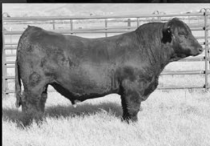
ONE RIGHT NOW BOULDER 90318L ASA 4322881

CE BW WW YW MK MRB RE SAPI $TI +12 +0.0 +82 +132 +26 -.01 +1.15 +114 +77