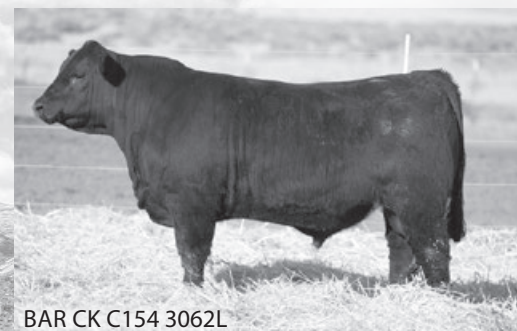
BAR CK C154 3062L

REG: 4318629 DOB: 10/2/23 (KBHR QUIGLEY C154 x BAR CK TARGET 3016A)