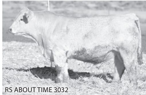
RS ABOUT TIME 3032

GUEST CONSIGNMENT FROM BAR CK CATTLE COMPANY, CULVER, OR