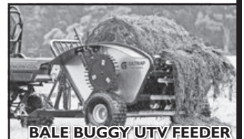
BALE BUGGY UTV FEEDER