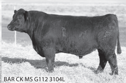
BAR CK MS G112 3104L

REG: 4318623 DOB: 10/21/23 (KBHR TBEF/BAR CK RETICLE G112 x GW VINDICATOR 312E)