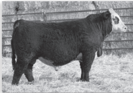
33635 AHA P44528652 09/10/2023 Sire: SHF Houston D287 H086 CE 3.4 | BW 2.9 | WW 72 | YW 119 | M 30 REA .64 | Mrb .28 | BMI 509 | CHB 155