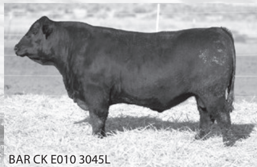
BAR CK E010 3045L

REG: 4318554 DOB: 9/26/23 (IR BEACON E010 x BAR CK TEBOW 1006X)