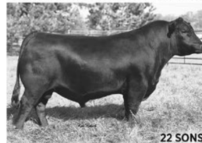
MYERS FAIR N SQUARE M39 AAA 19418329