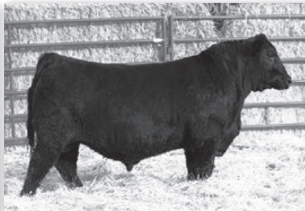
33301 AAA 20972835 08/26/2023 Sire: SITZ Incentive 704H CED 13 | BW -.9 | WW 67 | YW 125 M 33 | RE .54 | Mrb .85 | $M 95 | $C 267