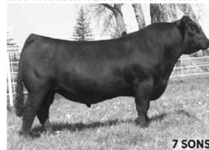
HCC WHITEWATER 9010 AAA 19870506