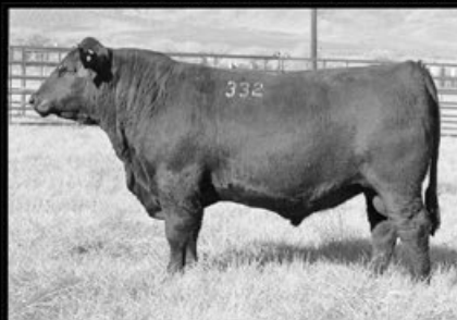
WESTWIND VERITAS DJH 332 AAA +*20726416

CEB BW WW YW MK MRB RE $B $C +13 -1.3 +72 +136 +30 +1.17 +1.13 +204 +334