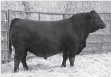
33323 AAA 20998683 09/01/2023 Sire: Raven Republic 1564 CED 11 | BW -1 | WW 74 | YW 128 M 29 | RE .77 | Mrb .85 | $M 65 | $C 263