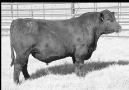
STERLING CLARITY 3153 AAA +*20759207

CEB BW WW YW MK MRB RE $B $C +6 +2.5 +93 +170 +12 +1.01 +1.55 +219 +329