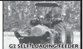
G2 SELF-LOADING FEEDER

The Giltrap next-generation RS2 heavy-duty bale feeder delivers safe, simple big bale feeding. Switch between round and square bales with no downtime. The low-impact conveyor teeth gently unbale the hay with minimum loss of valuable leaves and nutrients. The all-steel bale table and extra tall discharge pivot together, for even, no-fuss gravity feeding of any bale. The hydraulic direct drive is simple and trouble-free. A strong 2-cylinder arm picks up and sets bales on the table without dropping them. A sequence valve keeps the tines away from the table. Note the stable, wide stance, high clearance frame. Contact your local Nevada dealer.