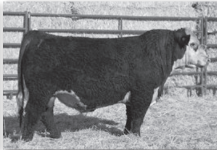
33275 AHA P44524037 08/24/2023 Sire: Canyon Gem 33Z C211 324G ET CE 8.4 | BW 1.1 | WW 72 | YW 111 | M 34 REA .62 | Mrb .38 | BMI 512 | CHB 166