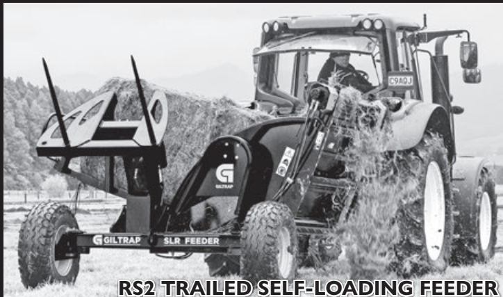
RS2 TRAILED SELF-LOADING FEEDER

The Giltrap next-generation RS2 heavy-duty bale feeder delivers safe, simple big bale feeding. Switch between round and square bales with no downtime. The low-impact conveyor teeth gently unbale the hay with minimum loss of valuable leaves and nutrients. The all-steel bale table and extra tall discharge pivot together, for even, no-fuss gravity feeding of any bale. The hydraulic direct drive is simple and trouble-free. A strong 2-cylinder arm picks up and sets bales on the table without dropping them. A sequence valve keeps the tines away from the table. Note the stable, wide stance, high clearance frame. Contact your local Nevada dealer.