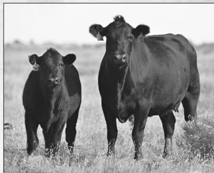
Bulls out of the most proven range cow herd in the Southwest.