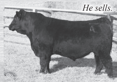
BSR BARKER COVENANT MJ8181 3/4 SM 1/4 AN ASA 4395234 HA COVENANT 30K son