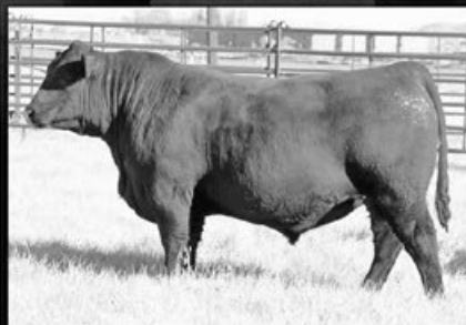
STERLING SALVATION 3145 AAA +*20760552

CEB BW WW YW MK MRB RE $B $C +7 +1.3 +80 +145 +17 +1.41 +1.00 +213 +331