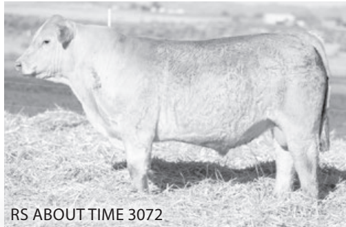
RS ABOUT TIME 3072

REG: M1004780 DOB: 7/21/23 (OW ABOUT TIME 9502 PLD ET x HC RIMROCK 4247)