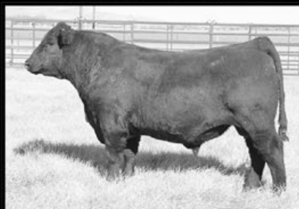
PFR ACE 3023 AAA +*20817535

CEB BW WW YW MK MRB RE $B $C +5 +2.5 +86 +152 +32 +1.48 +.82 +219 +352