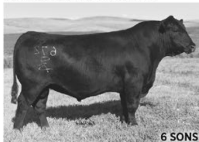
GB FIREBALL 672 AAA 18690054