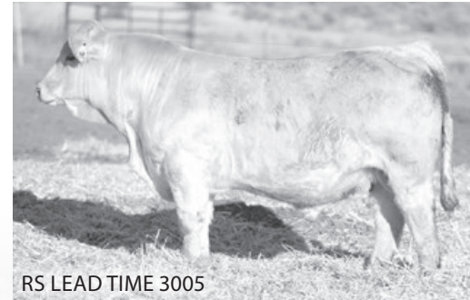
RS LEAD TIME 3005

REG: M1004736 DOB: 7/23/23 (OW LEAD TIME 6294 PLD x ABC CISCO 1 C243)